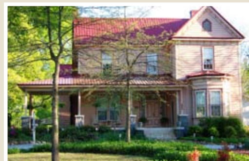
The Kinard House B&B

The Bernibrooks Inn 200 W Pickney Street Abbeville 864-366-8310